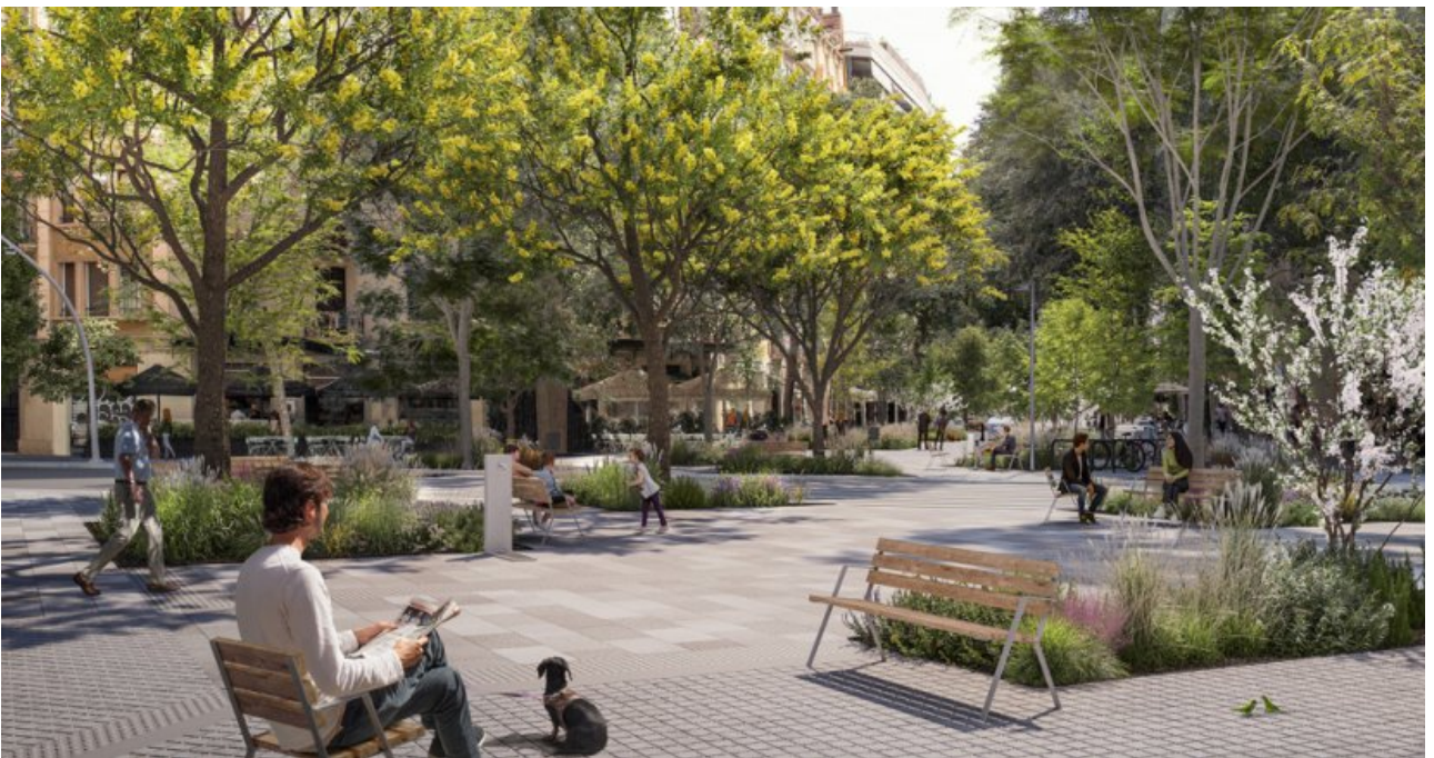
Render of the green axis projected on Rocafort street