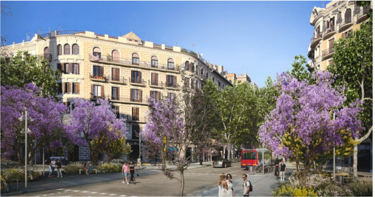
Render of the green axis projected on Consell de Cent street